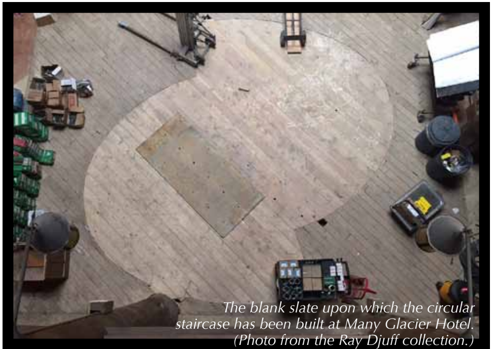
The blank slate upon which the circular staircase has been built at Many Glacier Hotel.

Two-thirds of Many Glacier Hotel were shut down in 2016 to accommodate the renovation program. The Hootenannies were held, on a much-reduced scale, in the Interlachen Lounge. This summer, because of changes in the lobby and the St. Moritz, the Hoots will move to the Lucerne Room, which can hold a substantial crowd.