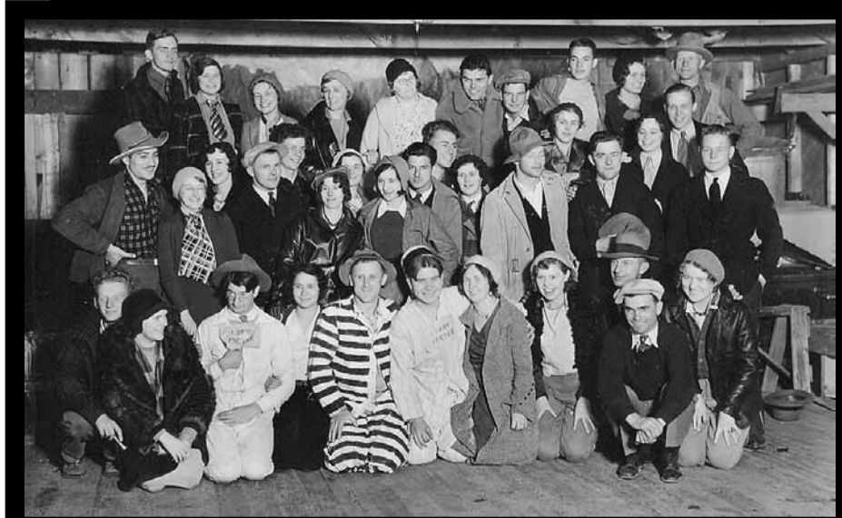
ABOVE: 1920's costume party; BELOW: band in the Bamboo Room.

The Inside Trail's Summer issue will feature an anthology of stories of Many Glacier's Broadway musicals. Readers are invited to send favorite memories and anecdotes to johnhagen@usfamily.net or to GPF, P.O. Box 15641, Minneapolis, MN 55415.