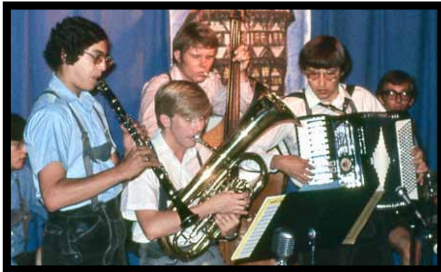
Oompa band at the 1975 Oktoberfest.

In the 1970s, an Oktoberfest-in-July was held, with an oompah band attired in lederhosen and abundant hot dogs and beer. For several seasons, a formal dance called the Bellmen's Ball was also held.