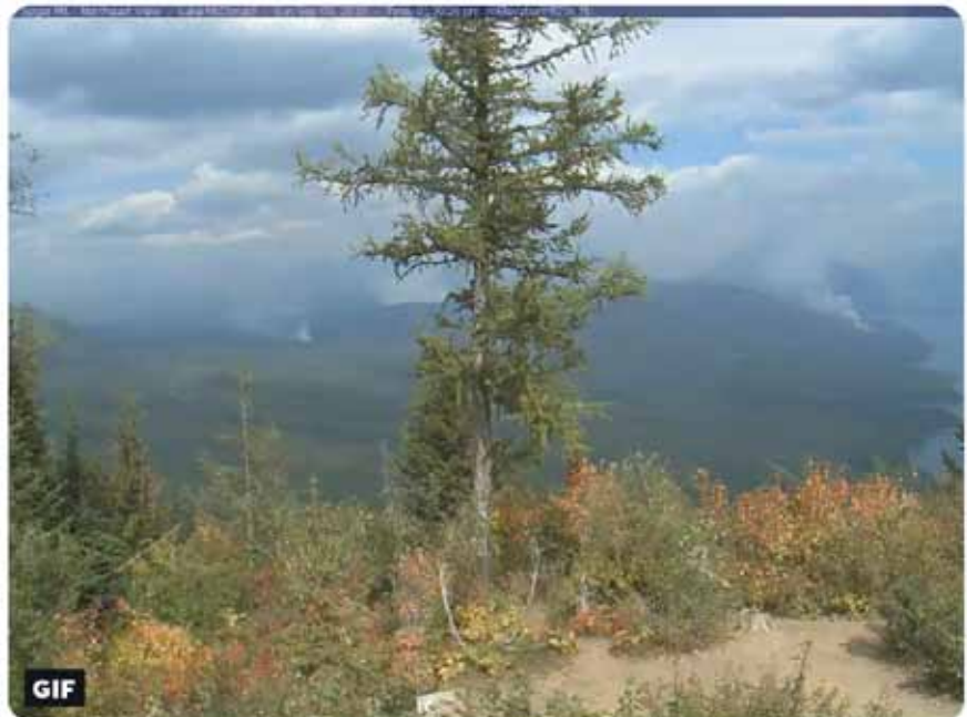
(September 9, 2018 looking northeast from Apgar Mountain Webcam.)

A concession employee relates a wry anecdote. After the evacuation, the Camas Road remained open west of Lake McDonald. She and some friends took an excursion there, and found the road beclouded with smoke. They drove through an area which was burned fifteen years before in the Robert Fire. The smoke momentarily parted, revealing an interpretive display about the ecology of forest fire. It was headed, “THANK YOU, WILDFIRE!”