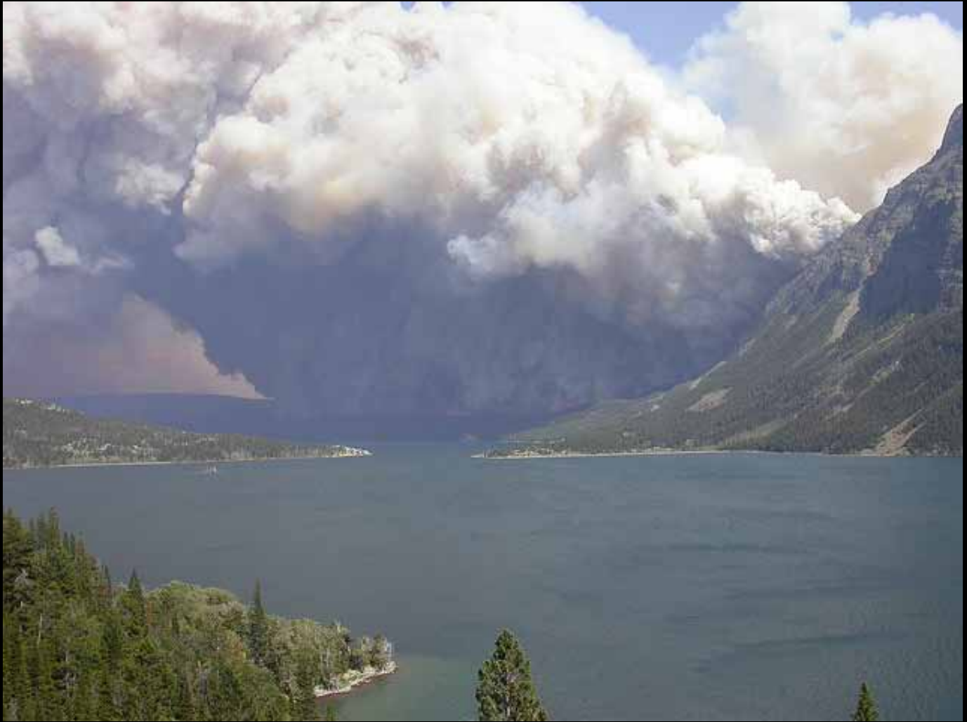
After August 12, 2018, the Howe Ridge Fire forced a full evacuation of the Lake McDonald Valley.